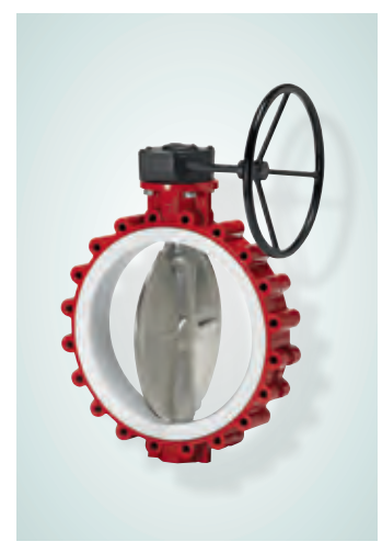
Type KG 6 DN 50 – DN 300